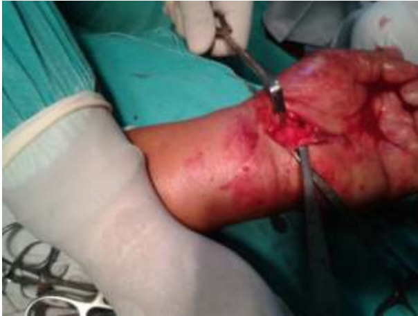
Intra-op Pic 1