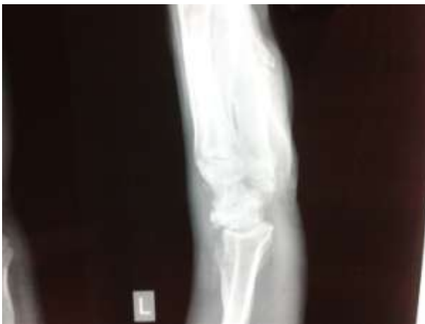
X Ray Left wrist Lateral