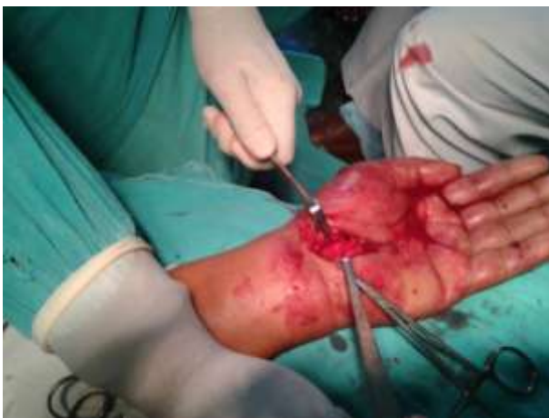
Intra-op Pic 2