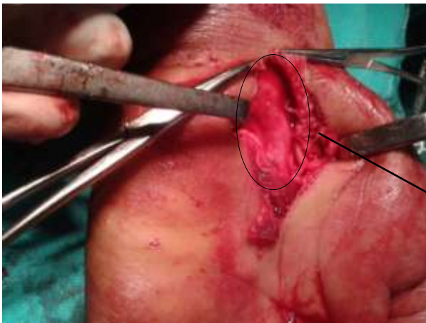
Intra-op Pic 3